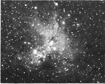
M16 NGC 6611 18h 16m.0 -13° 48' Cluster and nebula in Serpens

Basic data. The nebula is caused to shine by the cluster of hot blue and white stars. It is \frac{1}{2}^\circ in diameter and at a distance of 7,000 light-years from us.