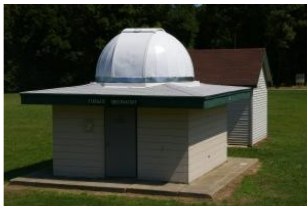
2010 Stargate Observatory Open House

Dates: Apr 24, May 22, June 19, July 17, Aug 21, Sept 11, Oct 16, Nov 13, Dec 11