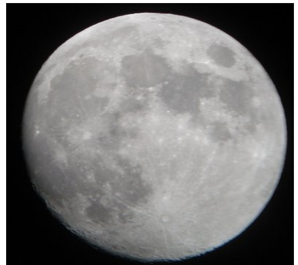
Nearly Full Moon