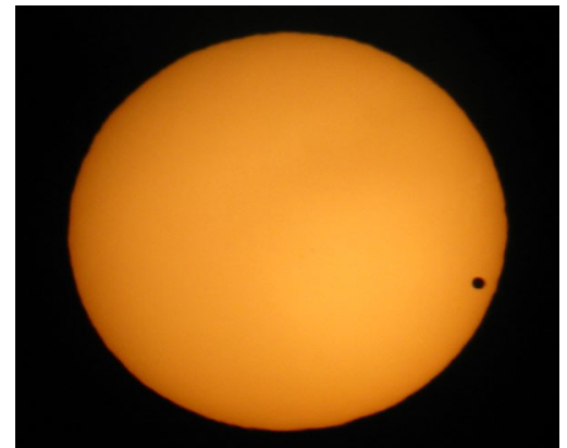
Transit of Venus by Jon Blum